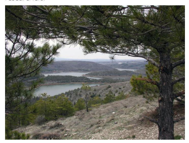
Rehabilitation of Lake Eymir

METU Campus also integrates natural and archaeological heritage, a sustainable built environment, a vivid social life, an advanced learning and research environment for its students, staff and researchers.