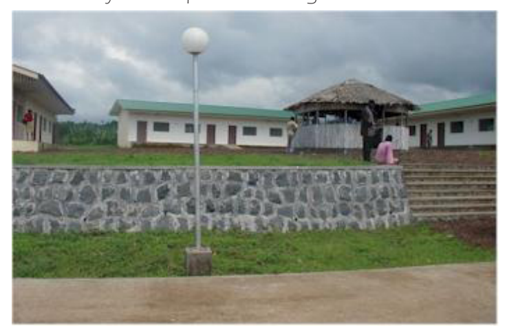
The Cultural Village at the University of Buea

Conceive and carry out research with postgraduate students on the trends and impacts of the phenomenon and utilise the results to further enhance the mainstreaming process and sensitise the community on adaptation strategies.