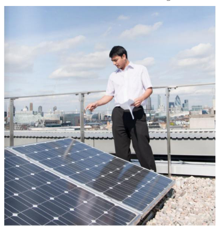
Background and overview of the innovation

A key consequence of the involvement of major global NGOs meant that the programme had access to global perspectives. In this way universities can utilise experience and perspectives from global civil society actors. A tutor team was also chosen from people active in the field rather than existing academics. This has made the programme more relevant but also more unusual within the academic setting.