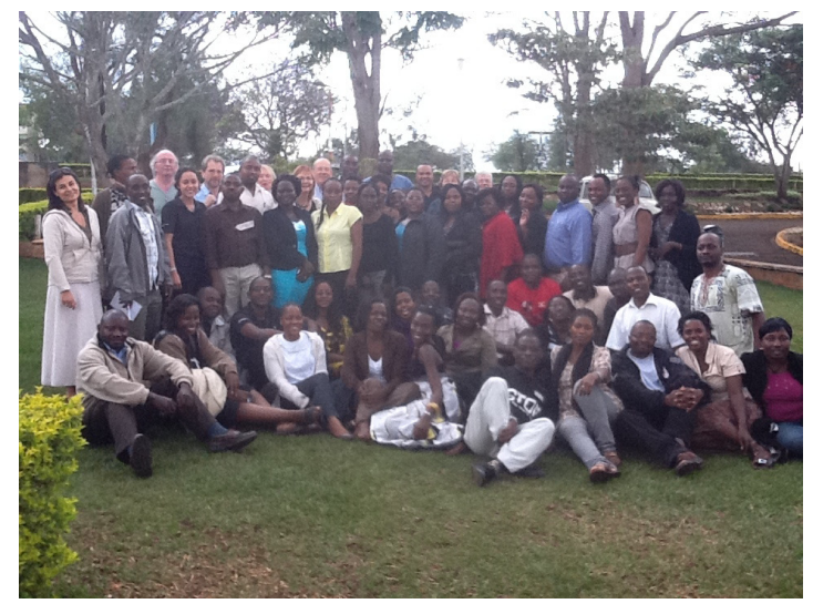
LSBU ESD African learning community tutors and students

The community engagement /development component is the focal point for activities and events, community outreach and conferencing in collaboration with RCE London.